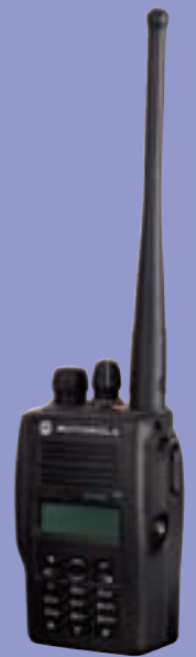
Compact, limited keypad with alpha-numeric display. GP388R & GP688R

Compact, full keypad with alpha-numeric display.